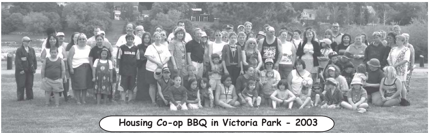
Housing Co-op BBQ in Victoria Park - 2003

Quint looks forward to being a part of an even brighter 10 years in the Core Neighbourhoods.