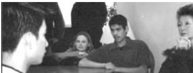
Adrienne Clarkson meeting with Youth Lodge residents

Governor General Adrienne Clarkson visited Saskatoon in January, with her husband John Raulston Saul. Along with a driving tour of our community, they went to a meeting hosted by White Buffalo Youth Lodge, and met with many community organizations. They stopped in at Quint's Youth Lodge and had a great discussion with some of the young men living there. They visited Infinity House, a transitional home for women run by the Central Urban Metis Federation.